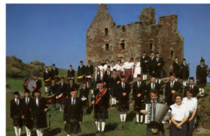
Fenton Tower – 1990