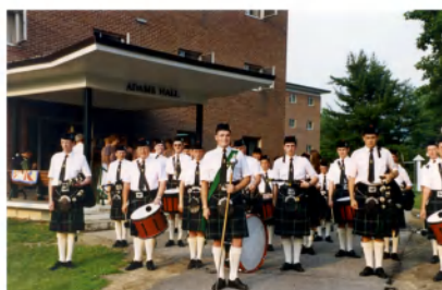
Adams Hall, Castleton College, Vermont

The following photograph was taken as a reminder.