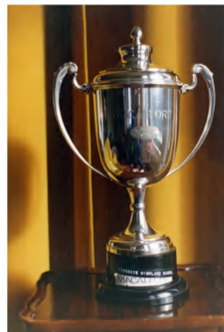
1st in Grade 3 at Bathgate – 1972

The Band was delighted to receive the Grade III trophy for Marching and Discipline at the 1972 World Championship at Hawick. Winners in Grades I and II were Edinburgh City Police and the 2nd Battalion Scots Guards respectively.