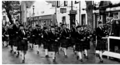
A typical damp Armistice parade.

Judging by the background buildings this photograph could be at the former East Fortune Hospital.