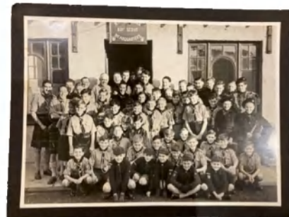
The 1st North Berwick Scout Troop from the early 1950's. Note a couple of the scouts on the right with drumsticks and obviously the bass drummer with a leopard skin.

One of the last appearances of this Scout Band was in the Coronation Parade in 1953.