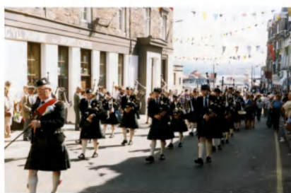
Cowal Games at Dunoon – 1983

The 'Tartan Fair' was an annual fundraising event that also took place during the summer. Organised and manned by band members and supporters.