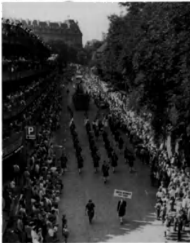
NORTH BERWICK PIPE BAND

With 20 pipers on parade this has been the largest turn out to date.