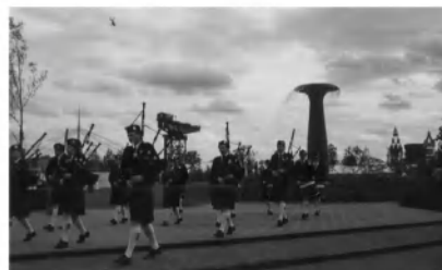
Glasgow Garden Festival – 1988

On the later USA trips the Band covered a fair distance playing in Massachusetts, Maine, New Hampshire, New York State and Vermont. The Band has also played at Quincy Market, Boston, the Fort Ticonderoga Tattoo and many 4 th of July Parades.