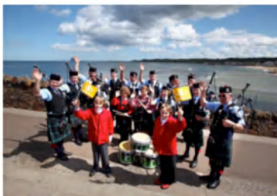
PuffinFest at the Seabird Centre

To this day the North Berwick Pipe Band still plays at local Galas, Fetes and other events during all the months of the year. The Band has also taken part in massed band events at Floors Castle, SRU matches at Murrayfield, Hogmanay Torchlight Procession in Edinburgh and local Beating Retreats.