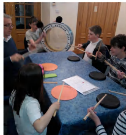
Sticks and Pads

During the period of this support we managed to encourage many youngsters to take up and progress on the pipes and the various types of drums.