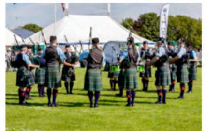
North Berwick Highland Games