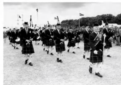
Game Fair at Gosford Estate 1990