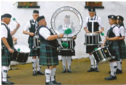
Just a few drummers

And all the while continuing our normal performances at home in the Lodge.