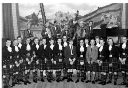
With Jimmy Shand in 1966

A separate project is underway to identify, where possible, the members of the Band through the years. Thanks to those who have already contributed and if anyone is able to assist further, please get in touch.