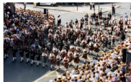
Massed Bands pass the National Gallery at the foot of the Mound

North Berwick Pipe Band were proud to have taken part in this first event in Edinburgh.