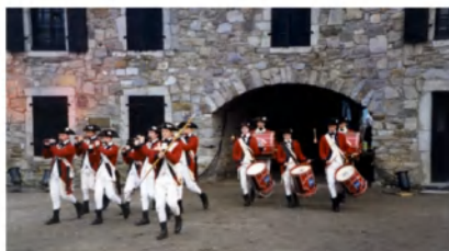
Fort Ticonderoga – 1994