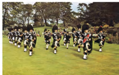
Direlton Castle 1972

The Band was delighted to receive the Grade III trophy for Marching and Discipline at the 1972 World Championship at Hawick. Winners in Grades I and II were Edinburgh City Police and the 2nd Battalion Scots Guards respectively.