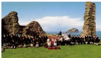
Tantallon Castle – 1994