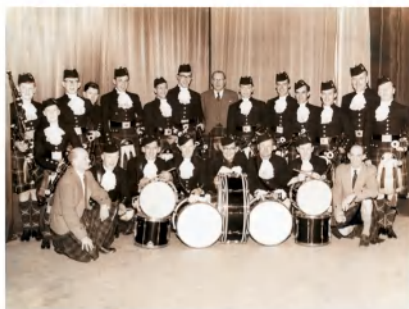
At the Harbour Pavilion in 1962

The Band played at various concerts and parades throughout the following years: