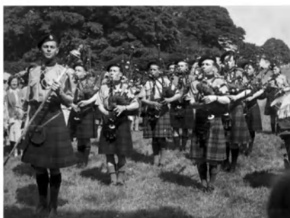
North Berwick Scout Pipe Band – 1950

The Danes gave an enthusiastic welcome to the pipes and drums. This Scout Band continued until about 1954.