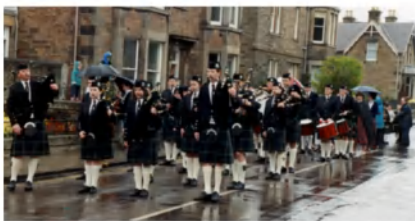
At Floors Castle