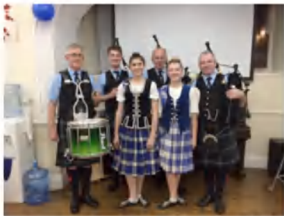
Local Care Homes for St Andrews Day

Homes is also part of the “community” side of the pipe band and it is well appreciated.