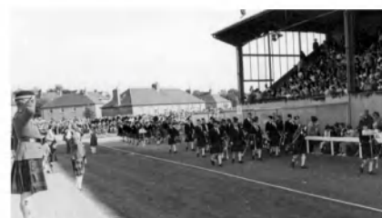
The march past at the Cowal Games

With the run up to the coming trips to the USA the band continued to perform around the County and Scotland.