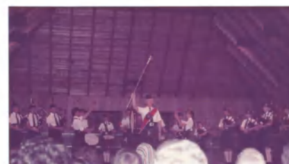
Old Orchard Beach, Maine