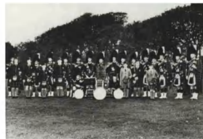
North Berwick Pipe Band including some of its Juvenile members