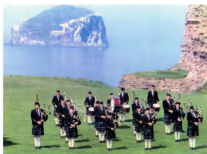
Tantallon Castle - 1984