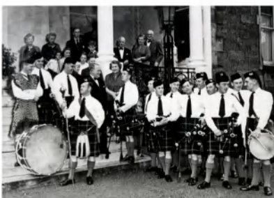
This picture (also on the

A donation from Red Hackle whisky allowed the band to adopt the McKenzie (Seaforth) tartan as the standard tartan for the Band and has remained so ever since.