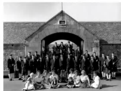
Tour Group at Kingstoun - 1990