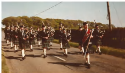
A practise before we go