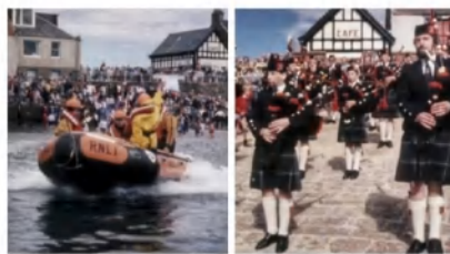
The launching of the 3 rd Blue Peter III inshore lifeboat in 1984

In the interim the band still carried out its normal duties, plus the occasional special event.