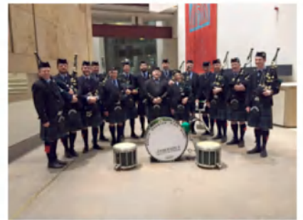
Burns Supper at National Museum for Scotland