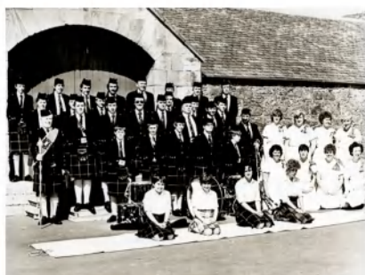
The Tour Group at Kingstoun