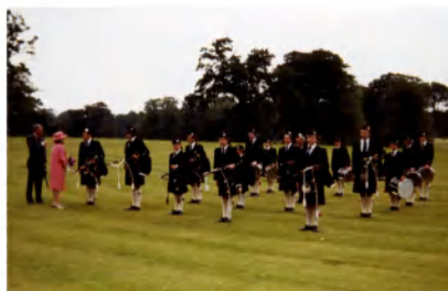
The visit of Princess Alice, Countess of Athlone

There have also been a few tunes written that have links to the band. In 1978 the 6:8 March 'Passing the Bass' was written and played by the band at that time.