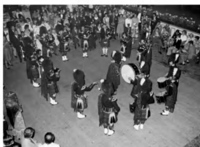
The Assembly Rooms, Edinburgh – 1975